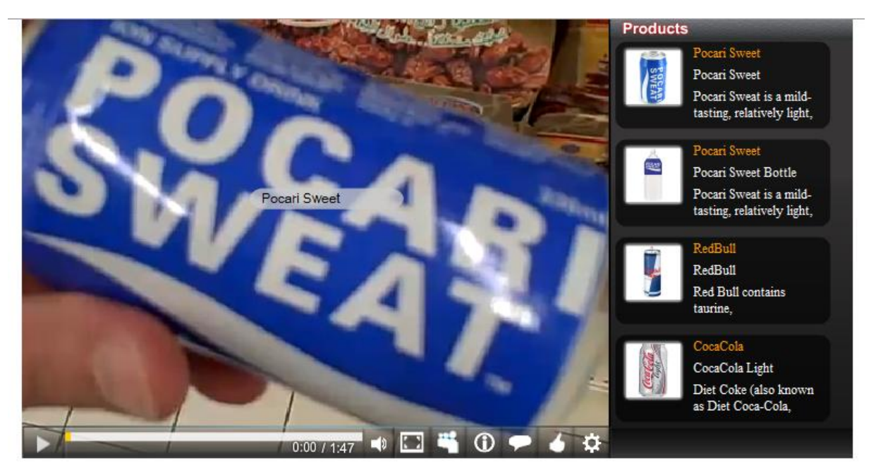
1. Custom video player that Bite Stream uses

The video player has basic functionality (seek, play, pause, volume, full screen) combined with custom modules to give the users the information they need. Users can see information about a product just by hovering the mouse over the desired object, and can see more details about that specific item by clicking over it. At that stage the user can see a description of the product, useful links where the product can be acquired, leave comments and even vote on topics proposed by the manufactures.